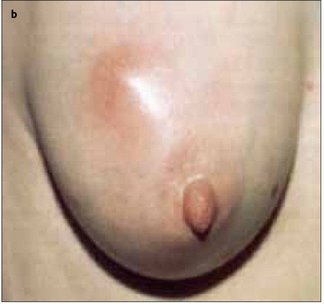
Figure 1. a, b. (a) Erythema associated with mastitis and (b) lactational breast abscess with visible swelling and erythema

Consider performing a pregnancy test if occurrence of mastitis is unexpected (e.g. in an adolescent).