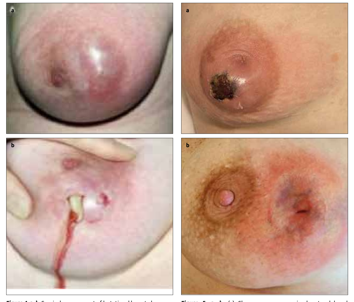
Figure 4. a, b. Surgical management of lactational breast abscesses (a) shows a lactational breast abscess with erythema, thin overlying skin and necrotic tissue (b) small I&D of a breast abscess

In lactating mothers milk stasis is often a risk factor for the development of mastitis and subsequent breast abscesses. It is essential that milk is removed frequently from the affected breast in order to manage it effectively (1, 54). The rate of abscess formation in lactating women with mastitis increases with the sudden cessation of breast feeding (1).