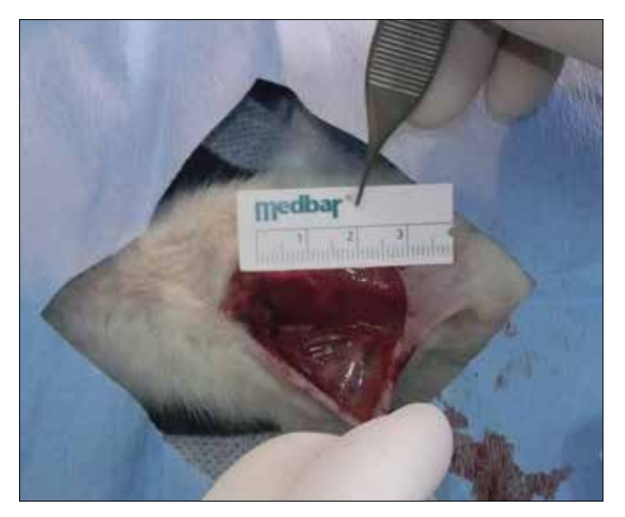
Figure 1. Measuring of dissection area after mastectomy and axillary dissection (Average dissection area is 3 cm<sup>2</sup>)

The dissection area was measured (Figure 1, 2). The average dissection area was found to be 3 cm<sup>2</sup>. After mastectomy and axillary dissection, no additional procedures were performed in the control group (Group 1). Porcine dermal collagen was postoperatively applied to 50% of mastectomy area in Group 2 and to 100% of mastectomy area in Group 3 (Figure 3, 4, 5, 6). After hemostatic control was established, the skin was closed with 2.0 silk sutures in all groups.