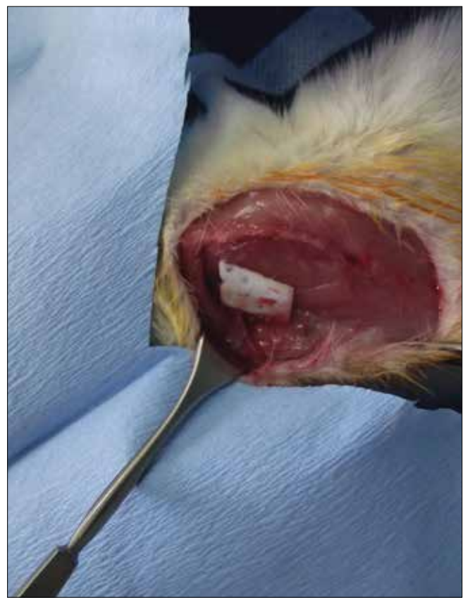
Figure 5. Applying porcine dermal collagen to 50% of dissection area

tion, polymorphonuclear leukocytes, growth of fibrous tissue, fibroblasts, lymphocytes, macrophages, granulation tissue, vascular proliferation and necrosis were evaluated qualitatively under light microscope. Cellular and histopathological data were scored semi-quantitatively in 0 to 3+scale as 0=absent, 1=mild, 2=moderate, and 3=marked.