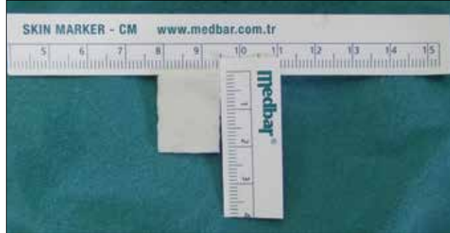
Figure 4 . Cutting the porcine dermal collagen to cover 100% of the dissection area