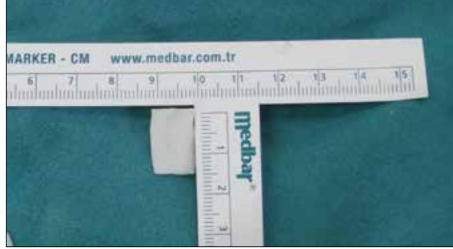
Figure 3. Cutting the porcine dermal collagen to cover 50% of the dissection area