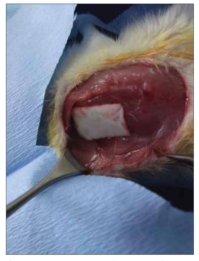
Figure 6. Applying porcine dermal collagen to 100% of dissection area

Vascular proliferation and granulation tissue formation were significantly higher in Group 3 in contrast to Group 1 and 2 (p<0.05); there was no significant difference between Groups 2 and 1 (p>0.05)(Figure 7). The congestion was found to be significantly higher in Group 3 in contrast to Group 1 and 2 (p<0.05). There was no significant difference in hemorrhage, macrophage, neutrophil, lymphocyte parameters among all the groups. Despite the fact that we observed more severe